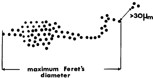
FIG. 2 Schematic illustration of the "near neighbor" concept and maximum Feret's diameter.

it is highly important that a clean polish be obtained and that the inclusions not be pitted, dragged, or obscured. It is recommended that the procedures described in Practice E 3 and Guide E 768 be followed. Automated grinding and polishing procedures are recommended. Examine specimens in the as-polished condition, free of the effects of any prior etching, if used.